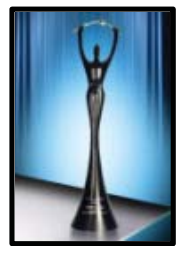
Electra Award 2005